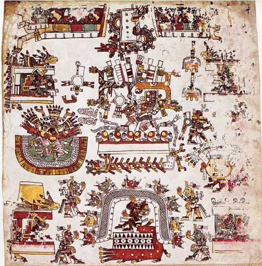
Figure 6. Codex Borgia page 45, depicting the god of the hunt, Mixcoatl-Camaxtli, honored in Quecholli at the beginning of the dry season (Restoration by Ian Breheny of photographic facsimile by Fondo de Cultura Económica, Anders, Jansen & Reyes García 1993).