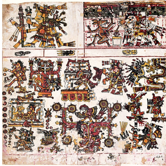
Figure 1d. Codex Borgia page 52, with detail of the year 4 Flint and day 5 Grass, referring to 7 February 1497 during Izcalli, the last veintena of the year (Restoration by Ian Breheny of photographic facsimile by Fondo de Cultura Económica, Anders, Jansen & Reyes García 1993)

day 4 Flint in the year 4 Flint, corresponding to January 24, 1497 in the Julian calendar employed until the 1582 Gregorian reform (Fig. 1d; Table 3; add 9 days for the Gregorian calendar equivalent). In a festival calendar with the year ending in Izcalli (XVIII), the day 4 Flint in the year 4 Flint on Codex Borgia page 52b would be positioned as the yearbearer on the last day in Tititl (XVII), as in Table 3. But if the veintena began a half day earlier than the tonalpobualli day, as I have proposed, the yearbearer would fall on the first day of Izcalli, the last 20-day veintena festival in the calendar, as in Table 4.