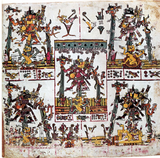
Figure 2. Codex Borgia page 28, with year dates that begin on the lower right with 1 Reed, followed by 2 Knife in the upper right, and 3 House in the upper left, and 4 Rabbit in the lower right and 5 Reed in the center (Restoration by Ian Breheny of photographic facsimile by Fondo de Cultura Económica, Anders, Jansen & Reyes García 1993).

Even though the narrative on Codex Borgia pages 29-46 lacks any year dates, it falls in the same 52-year cycle laid out on Codex Borgia page 27. The yearbearer 4 Flint on Borgia 52 represents the year 1496, the same year associated with the narrative on pages 29-46. This is the year of a total solar eclipse depicted on