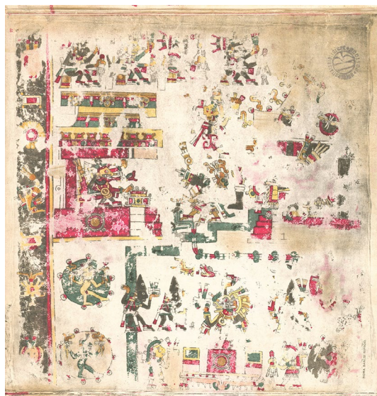
Figure 5. Codex Borgia page 37, showing Tlaloc the god honored in Etzalcualiztli, standing on rain clouds, while a solar god plays music on the summer solstice (1898 Loubat edition, Wikimedia Commons).