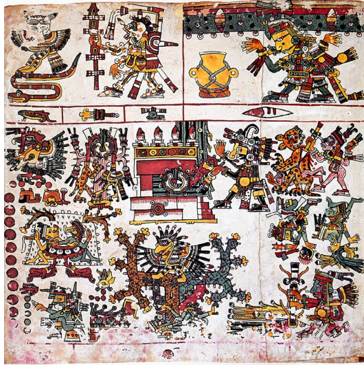
Figure 1b. Codex Borgia page 50, with the year 4 Rabbit and day 5 Wind referring to 14 February 1471 during Izcalli, the last veintena of the year (Restoration by Ian Breheny of photographic facsimile by Fondo de Cultura Económica, Anders, Jansen & Reyes García ).