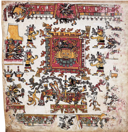
Figure 7. Codex Borgia page 46, showing the fire serpents and fire ceremony in Panquetzaliztli, the veintena of the winter solstice (Restoration by Ian Breheny of photographic facsimile by Fondo de Cultura Económica, Anders, Jansen & Reyes García 1993).